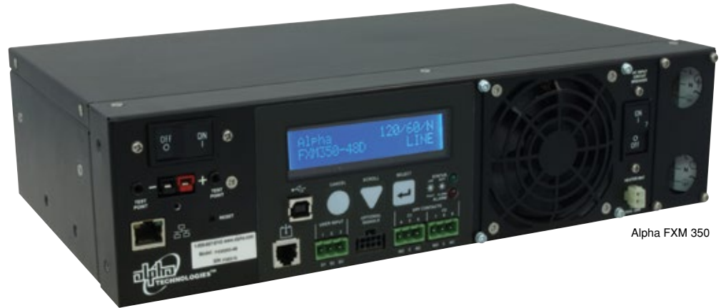
Alpha FXM 350